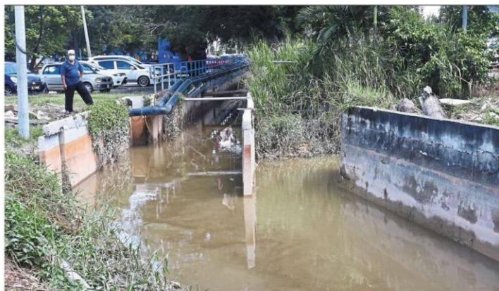
Mohammad Daud standing at the confluence of two monsoon drains at Jalan Teratai, where backflow leads to flash floods in Meru, Klang.