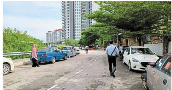
The police and MBSJ enforcement officers acting on complaints of illegally parked vehicles along Jalan Pipit 4.

MBSJ added that the city council and the police would continue to monitor and prevent traffic obstructions by enforcing the laws as well as ensure that the roads were safe from obstructions that could endanger other road users.