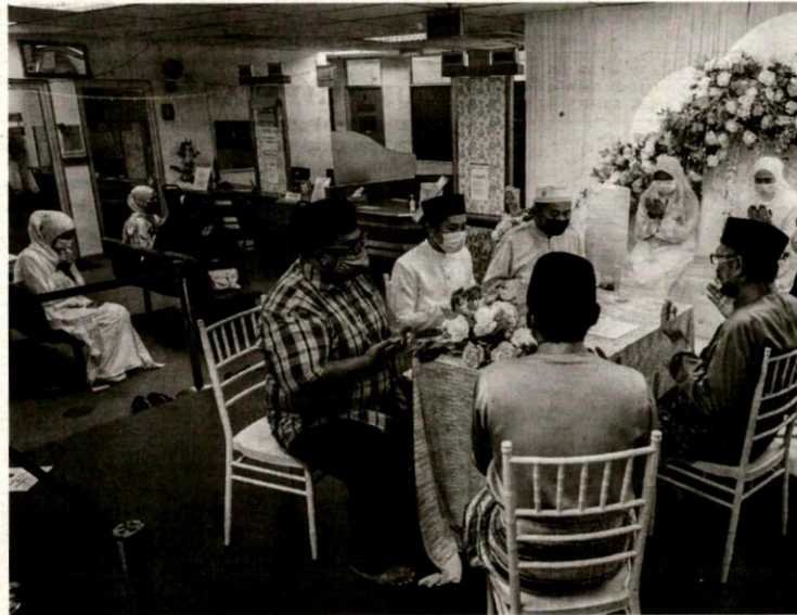
MASIH ramai pasangan yang sudah berkahwin, namun masih belum menuntut sivil atau kad nikah di pejabat agama daerah. - GAMBAR HIASAN/SHIDDIEQIN ZON