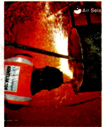
Sebanyak 41 kawasan di Gombak terlibat gangguan bekalan air sejak Sabtu susulan insiden paip pecah berhampiran jambat Ampang Point.

“Sebarang aduan dan pertanyaan hubungi Pusat Perhubungan Air Selangor di talian 15300 atau help centre di www.airselangor.com ,” jelas kenyataan itu.