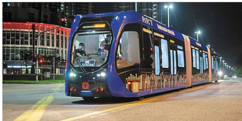
This tram was tested in Iskandar Malaysia. The feasibility of a fully electric one using the ART system will be assessed in Cyberjaya next year.